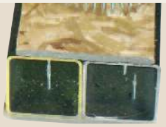
FLVL41 - Power Driver