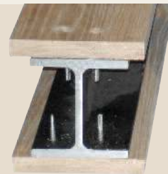
HDVL71 - Heavy Duty Driver

We stock Super Wing fasteners suitable for all your applications including ACQ lumber and Stainless Steel. Call us for details!