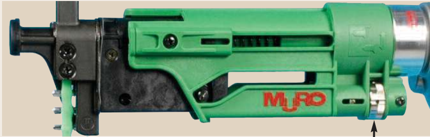
CH7241 - Attachment