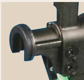
Non-Marking Rubber Nose